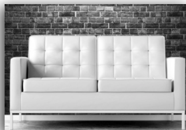
[ furniture ]